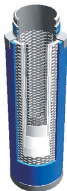
Cross section of the Ultrair ® depth filter

By utilising various filtration mechanisms such as retention by direct impact, sieve effect and diffusion effect, liquid aerosols and solid particles down to the size of 0.01 µm are being retained in the filter.